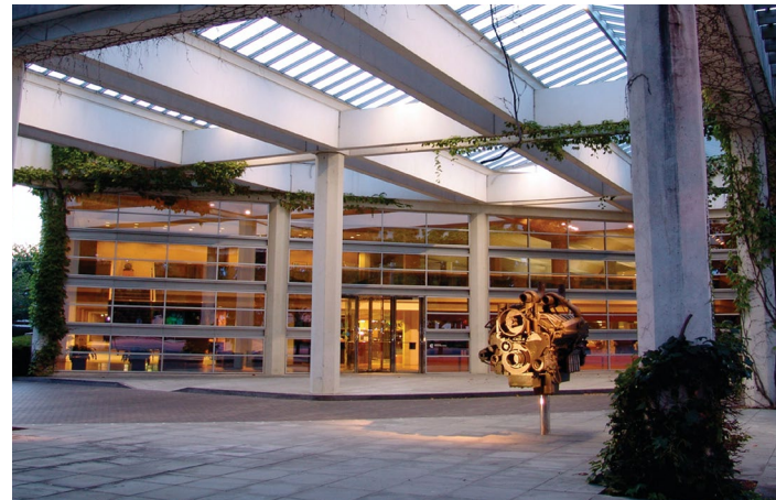
Constructed in 1983, the Cummins Corporate Office Building helped give a modern look to the historic 19th century cereal mill it was built around.