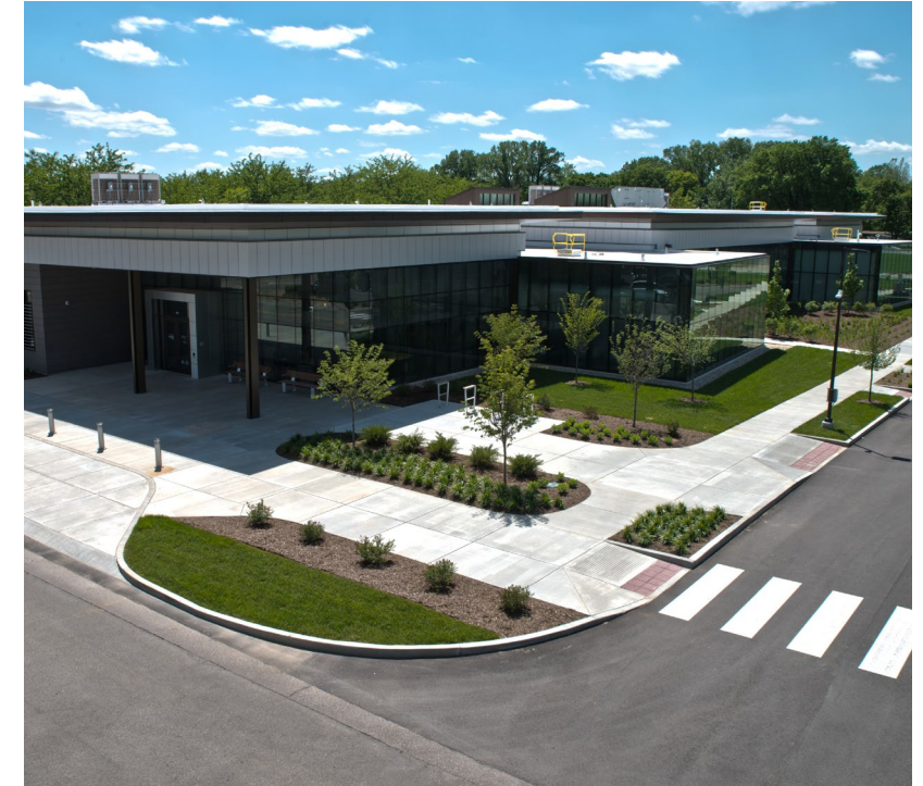
Opened in 2016, the Cummins LiveWell Center has helped bring high quality healthcare closer to all Cummins employees and their dependents with the goal of improving health outcomes for all employees and their families.