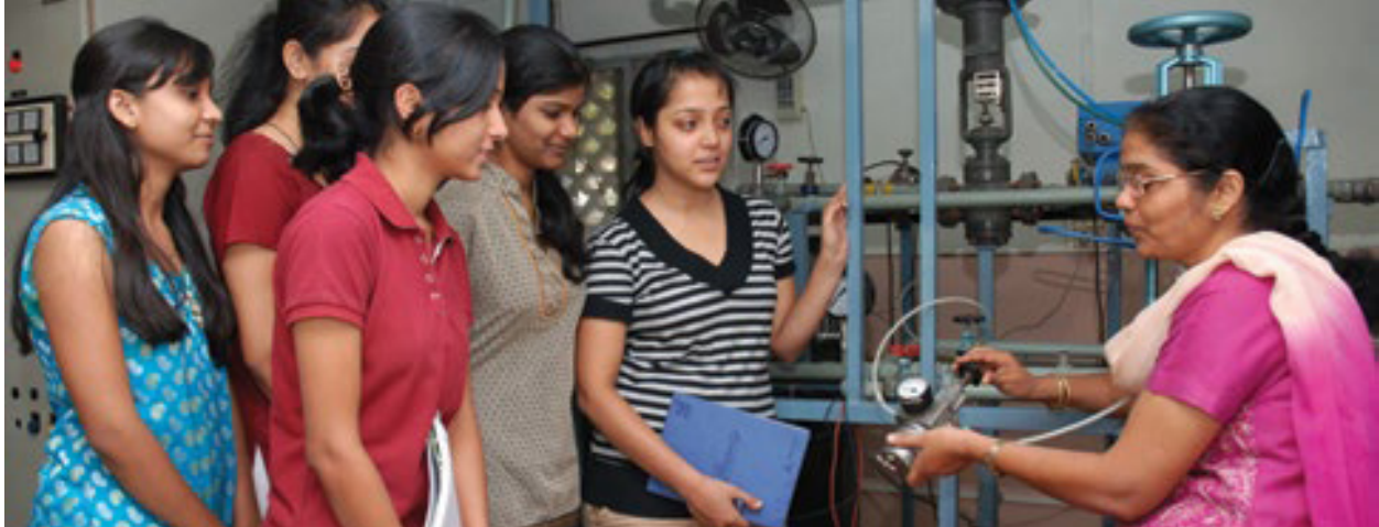
Cummins College of Engineering for Women in India serves an underrepresented demographic in the engineering field.

Q How can I get involved in community activities at Cummins?